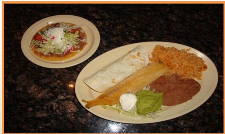
Zapata's Combo Plate

Choose a soft or crunchy Taco, a hearty Burrito, a crispy Tostada, a cheesy Enchilada or hot Tamal for your choice of three delicious entrees on one plate. Served with lettuce, sour cream, rice and beans. Your choice of seasoned beef, bean, or chicken, Includes fresh salsa.