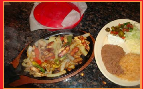
Chicken Fajita Platter

Sorry. no substitutions, Fresh Salsa extra